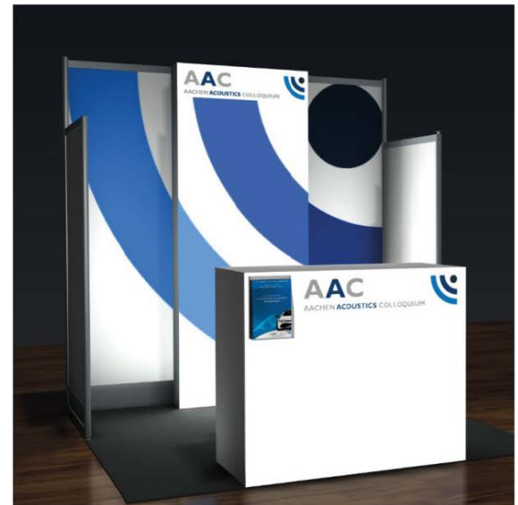
Illustration includes optional equipment and further graphics