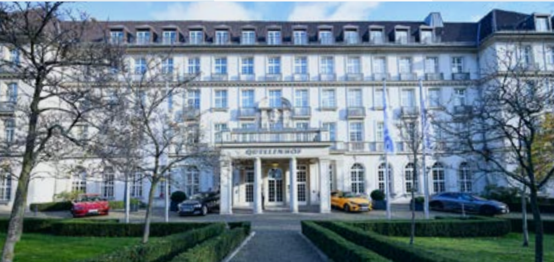
Parkhotel Quellenhof Aachen, Germany

Are you looking for new ideas and methods to improve the acoustics and vibrations of vehicles and drives? The Aachen Acoustics Colloquium is the perfect opportunity for experts from both industry and research to exchange knowledge and ideas within the field of acoustics and vibrations of vehicles. With 20 technical presentations and 2 plenary speeches, you can stay up-to-date in this ever-evolving field. Attend the Aachen Acoustics Colloquium to get the competitive edge that you need and to get familiar with the latest innovations and insights around acoustics and vibrations of vehicles and drives.